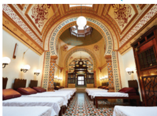
Turkish Baths and Health Spa in Harrogate