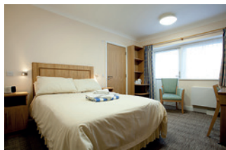
Inside St Andrews

If you are looking for a weekend break with delicious food and drink, fantastic shopping and great places to explore, then St Andrews, Harrogate, is the place for you.