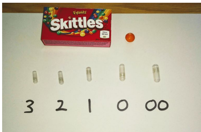
Figure 2 Dummy gelatine capsules in order of size compared with typical sweets (vegan non-gelatine capsules are also available).

In a short time frame it is possible to embed a system to convert children to tablet medication, improve the families' experience of obtaining medication and realise considerable cost savings. It requires staff training and cultural change. Pill swallowing is an easy skill to teach and learn, and children as young as 5 can