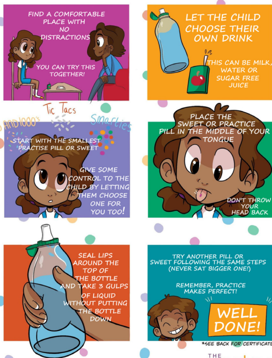
Figure 1 Comic poster teaching children to swallow tablets. This work is licensed under a Creative Commons Attribution 4.0 International License.