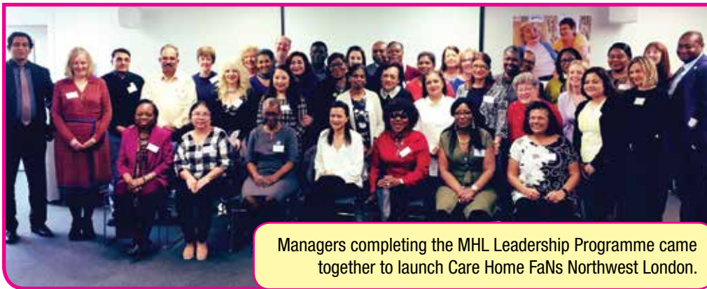
Managers completing the MHL Leadership Programme came together to launch Care Home FaNs Northwest London.