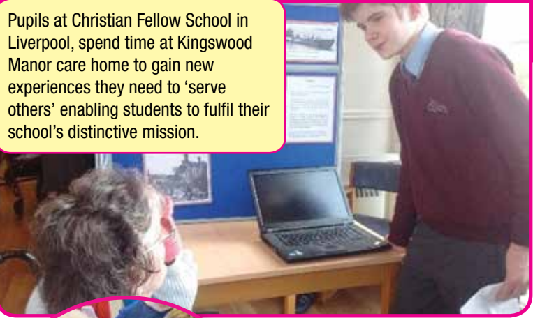
Pupils at Christian Fellow School in Liverpool, spend time at Kingswood Manor care home to gain new experiences they need to 'serve others' enabling students to fulfil their school's distinctive mission.