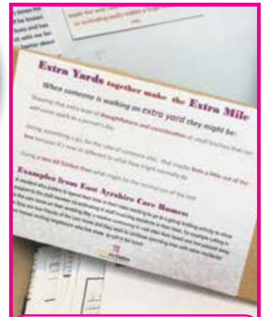
In East Ayrshire, the Kinctions project has been working hard to collect positive stories from care homes in their work 'Extra Yards together make the Extra Mile'. For more information visit http://myhomelife.uws.ac.uk/scotland/