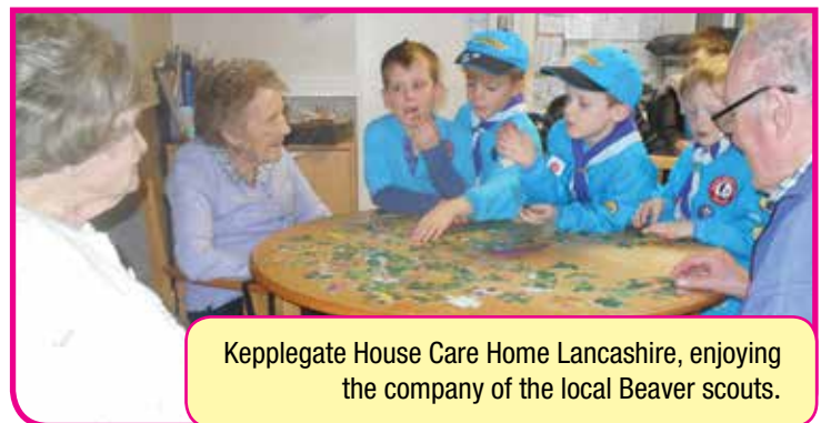
Kepplegate House Care Home Lancashire, enjoying the company of the local Beaver scouts.