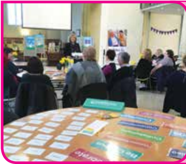
A community of care home Managers in Suffolk who completed the MHL Leadership Programme, reunited after 6 years, at a special event.