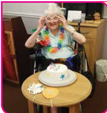
The 'Bake a Smile' project recruits local bakers to gift scrummy cakes to care home residents. To learn more visit @thebakeasmileproject on Facebook.