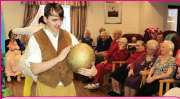
The Withins Residential home hosted a performance of Jack and The Beanstalk for residents and guests from the local community.