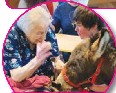
'Donkey-ing around'! at Ashmore Nursing Home in Suffolk.