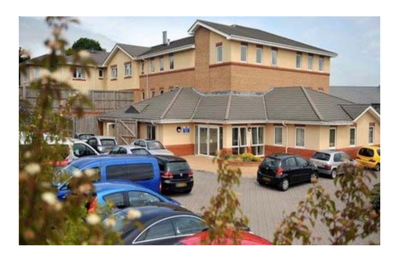
Easy Read version