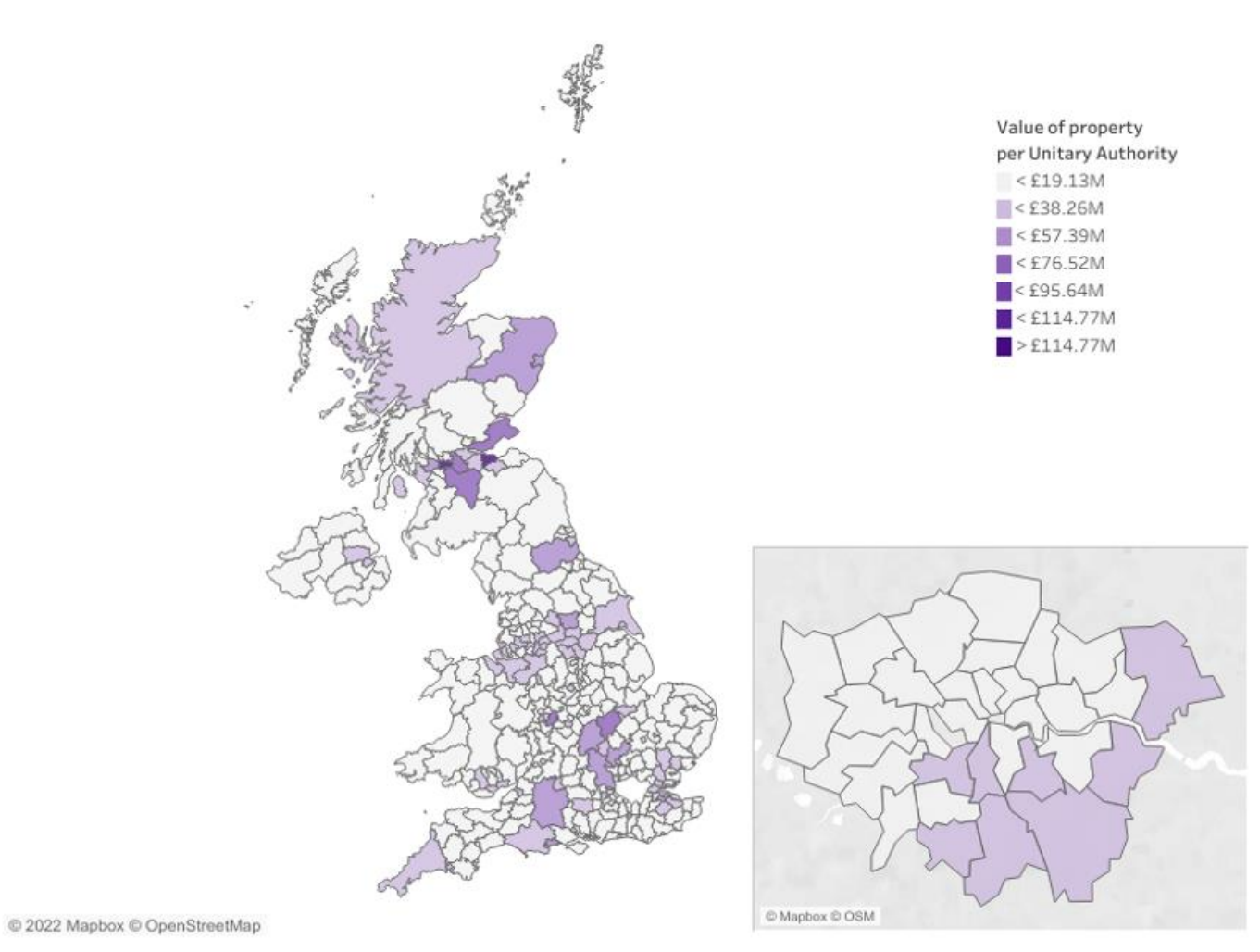
Map 1: Location and value of completed mortgages supported by the 2021 mortgage guarantee scheme from 19 April 2021 to 30 September 2022, by local authority, UK